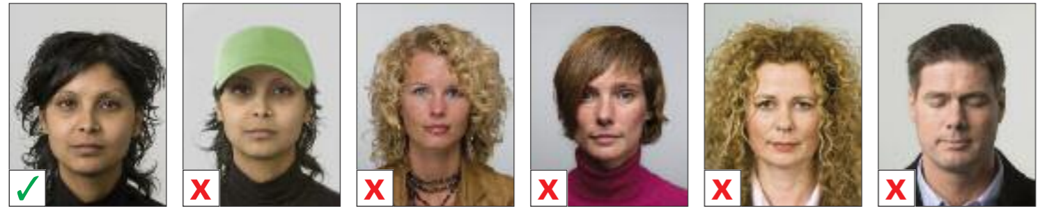
CORRECT A. Head covered B. Face not entirely visible C. Face not entirely visible D. Face not entirely visible E. Eyes not visible