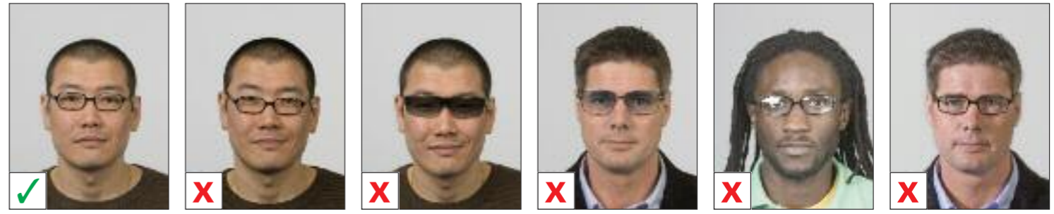
CORRECT A. Eyes not entirely visible B. Tinted lens C. Tinted lens D. Reflection E. Shadow