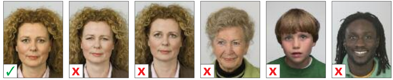
CORRECT A. Not a neutral expression B. Not looking straight at the camera C. Not looking straight at the camera D. Mouth open E. Mouth open