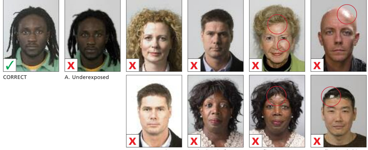
CORRECT A. Underexposed B. Overexposed C. Shadow in face D. Reflection E. Reflection (white spots)