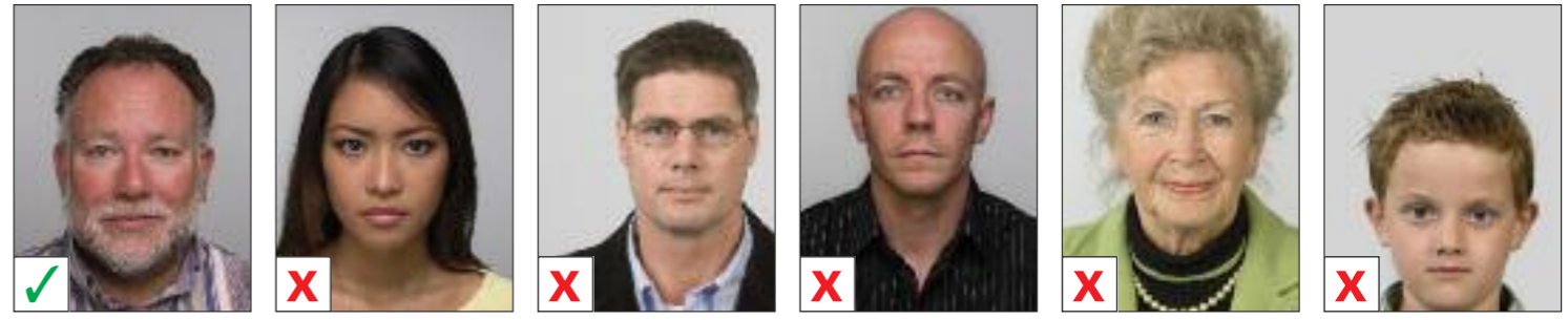
CORRECT A. Not centred B. Not centred C. Head too high D. Head too high E. Head too low